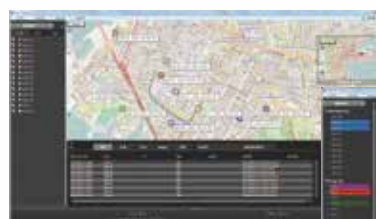
Main AVL screen