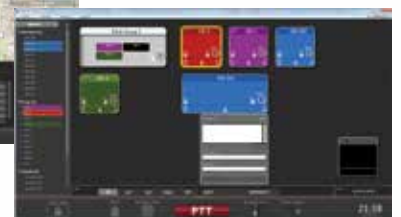
Main Dispatch screen