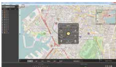
AVL: Unit Operation