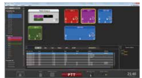
Dispatch: List Display

Specifications are subject to change without notice, due to advancements in technology. OpenStreetMap® is open data, licensed under the Open Data Commons Open Database License (ODbL) by the OpenStreetMap Foundation (OSMF). Microsoft, Windows, and SQL Server are trademarks, or registered trademarks of Microsoft Corporation in the U.S. and/or other countries. Intel and Core are trademarks of Intel Corporation in the U.S. and/or other countries. AMBE+2™ is a trademark of Digital Voice Systems Inc. All other product names referenced herein are trademarks or registered trademarks of their respective manufacturers.