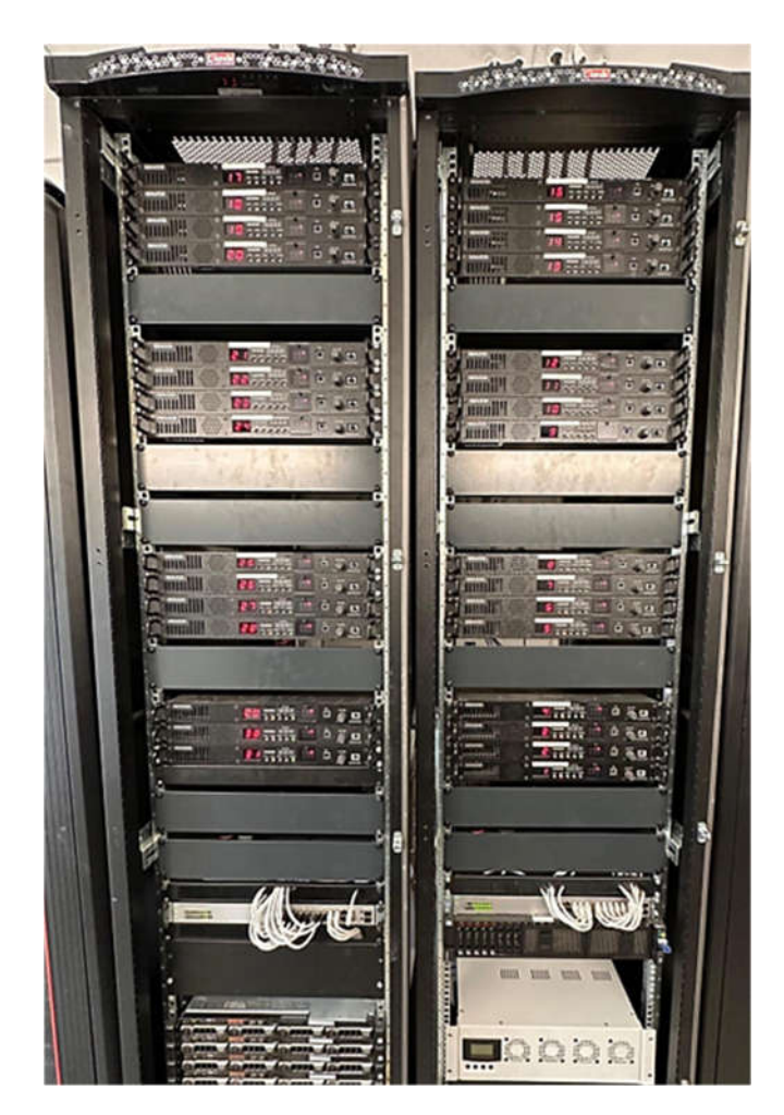
The new system is housed in a secure, dedicated radio room located away from the main terminal building and is served by its own 50m antenna tower.